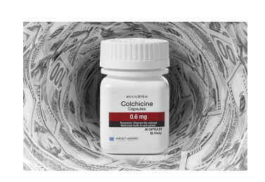
Otto CM. Heartbeat: Colchicine and heart disease. Heart 2016;102:567-568.