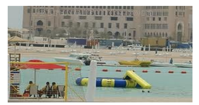
Katara Cultural Village (a 10 Minute drive from QU)

The Villagio Mall – for a Doha shopping experience