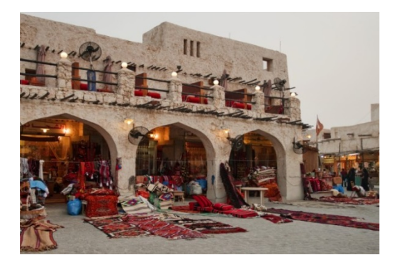
Traditional Market (Souq Waqif)