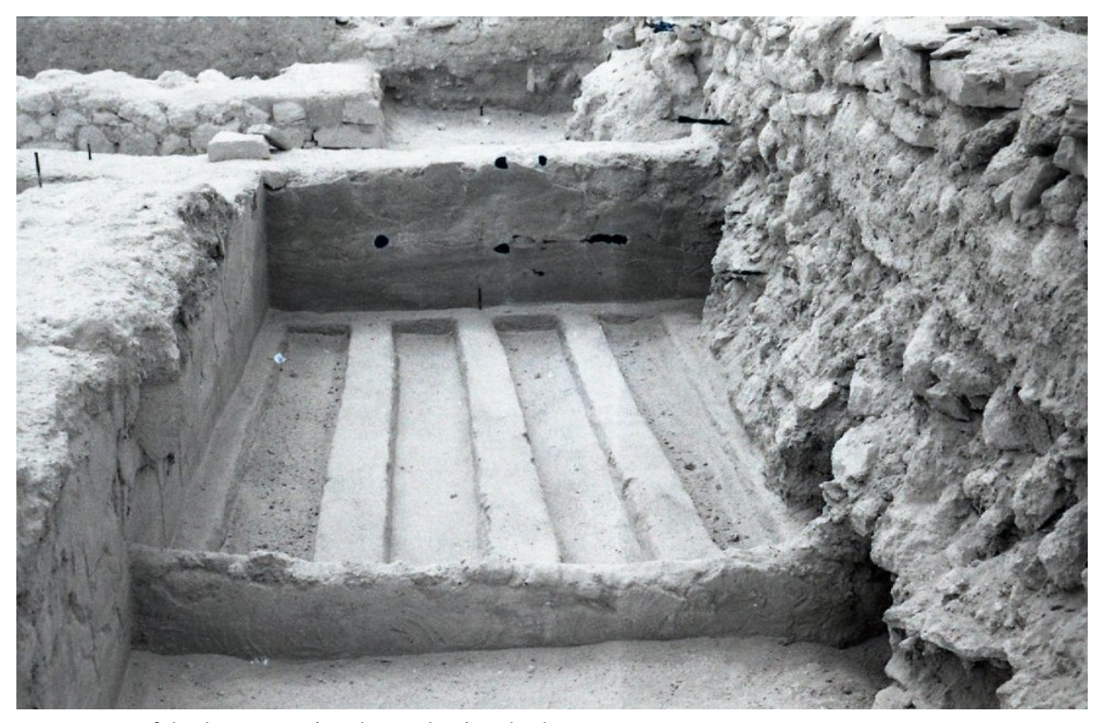
Figure 2: One of the date presses (Northern Palace) at Al-Zubara site

Dates were packed in sacks and placed on the edges of sloped ridged floors of the madabis with weights on top. The compression would make the dates release a sweet sticky syrup ( dibs ), which would drip into an underground sunken collecting jar placed at the end of the channels. These pressing and collecting areas were accessible through a direct entrance from the street.