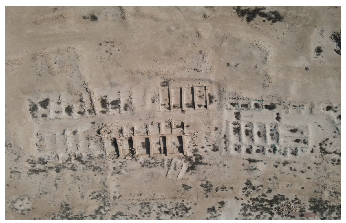
Figure 1: Aerial view of the date presses in Al Zubarah Soug (Al Zubarah archaeological site) a World Heritage Site

Madbasas are built as small rectangular or square shaped rooms with a single entrance. All parts of the floor and interior wall of the madbasa are covered with lime and Sarooj mortar. The technique used is based on building two longitudinal walls consisting of two outer screen walls made of stones rich in fossils and seashells, and between them are irregular stone infill, with gravel and mortar made of mud. The inner walls of the madabis were mostly made of beach rocks; a material which is not solid, and largely composed of salts or shells that are still visible on its surface. The depth of the foundations of these walls and their underground thickness are yet to be determined. However, it has been observed that these rooms tend to have varying dimensions and measurements, depending on the owner's financial capacities.